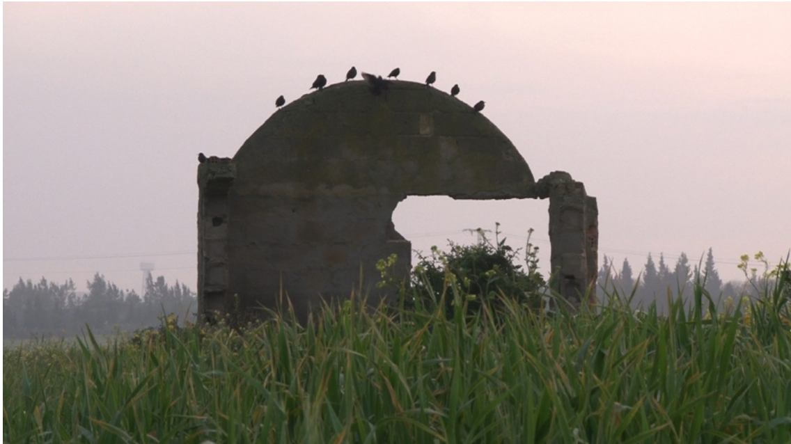
Ala Eddine Slim, Stones ربي كرسي, 2017, Vidéo, 7 mins