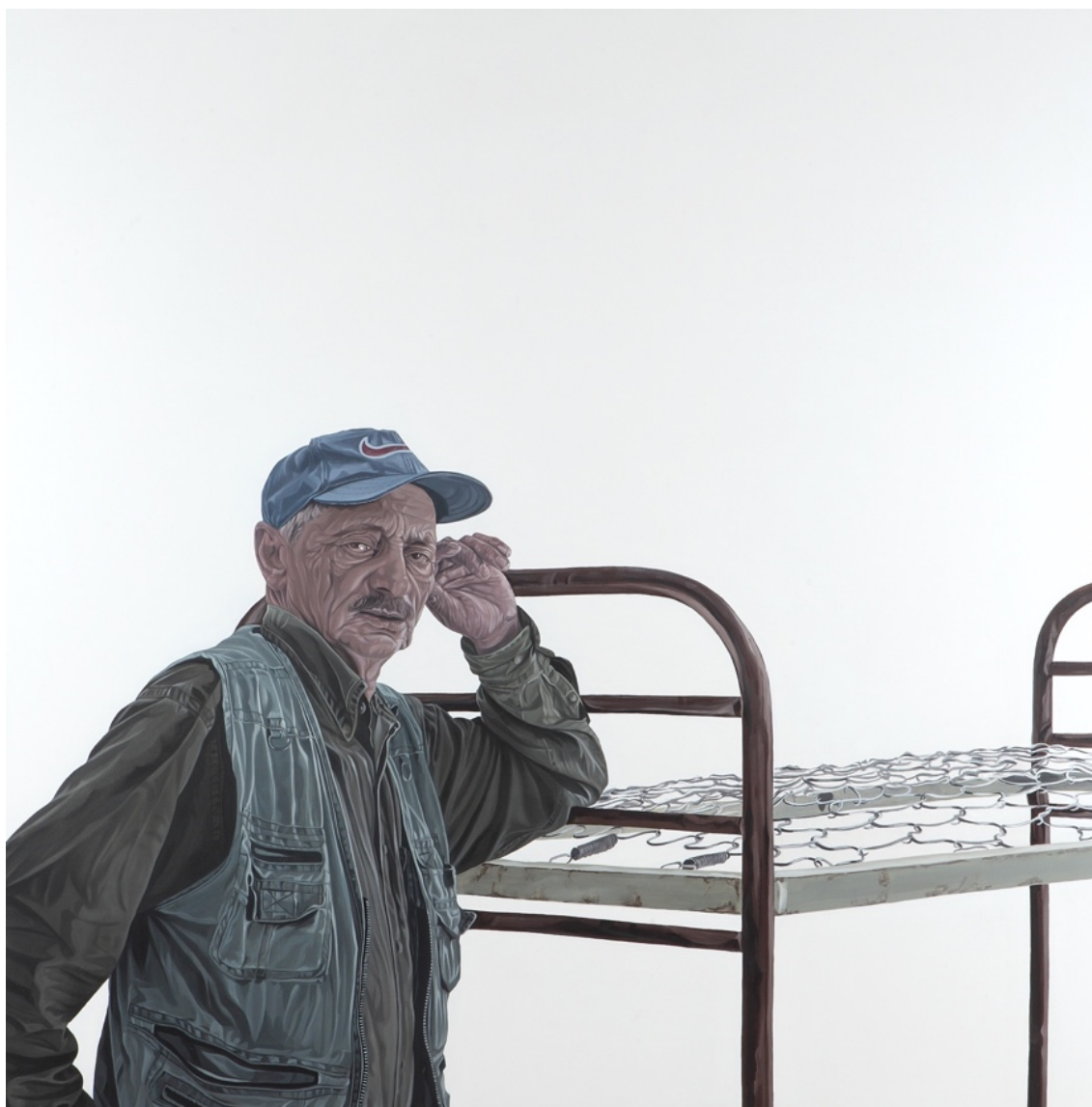
Atef Maatallah, La passion de Am Salah, Acrylique sur toile, 200x200 cm