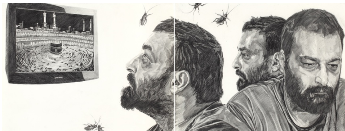
Atef Maatallah, Chambre 6, 2017, Diptyque, Mine de plomb sur papier coton, 57x153 cm