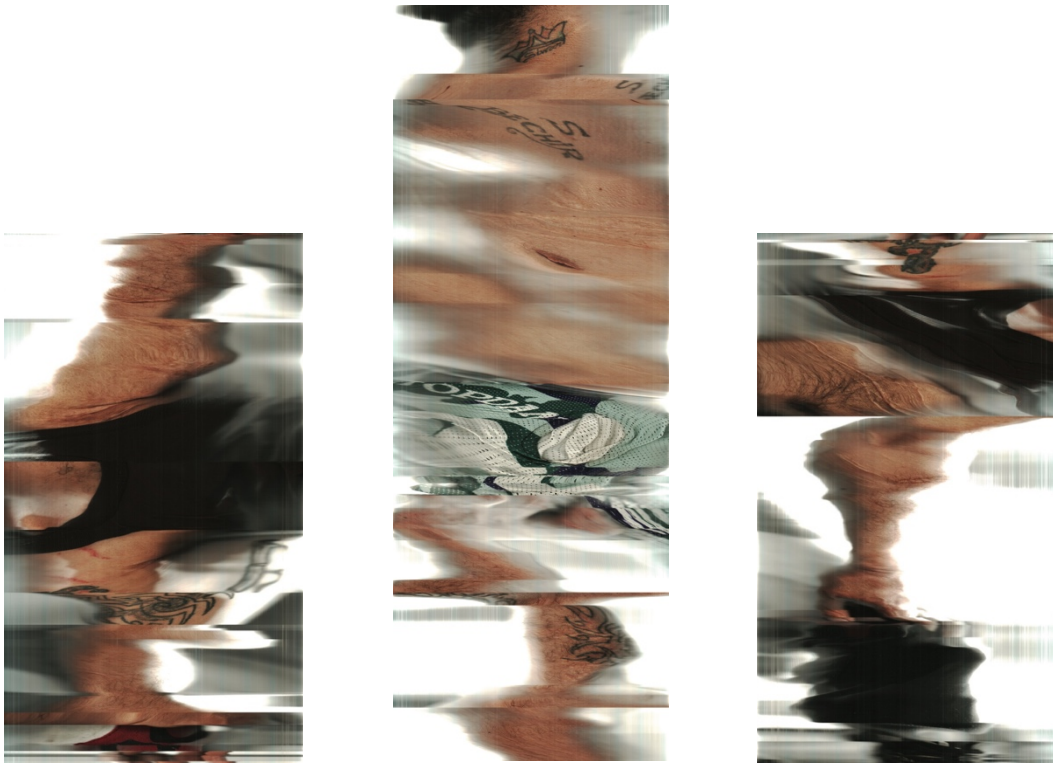
Ala Eddine Slim, SCAN 01-02-03, الحيه للحمه , Scannage, caisson lumineux, 71x40 cm / 110.25x40 cm / 71x40 cm