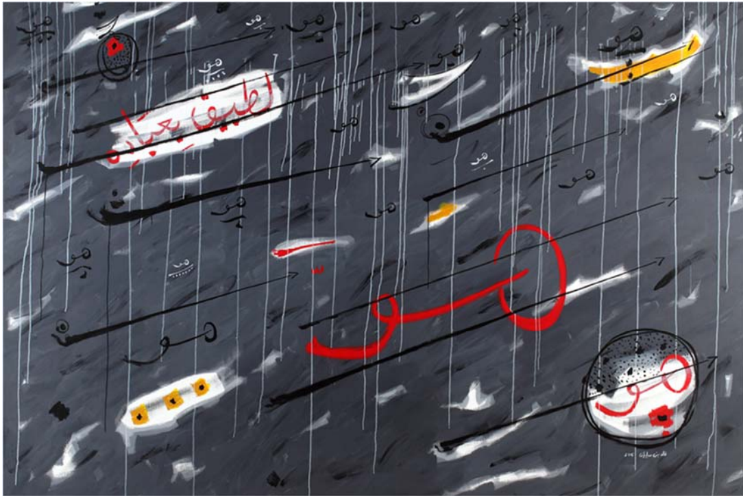
Khaled Ben Slimane, Howa IX, 2015, Acrylic on canvas, 200 x 300 cm