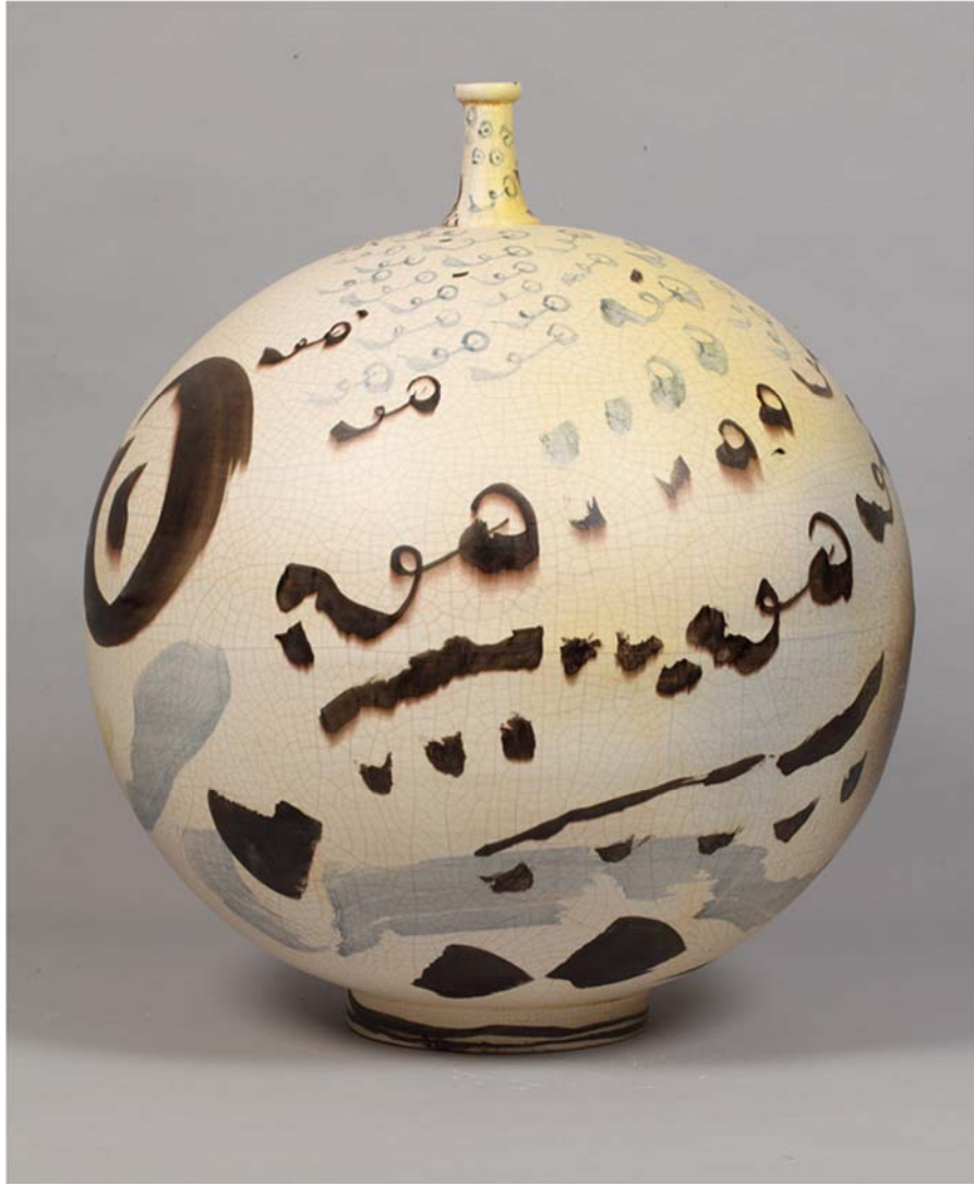
Khaled Ben Slimane, White Rotund, 2016, Ceramics, H.58 x 50 x 50 cm