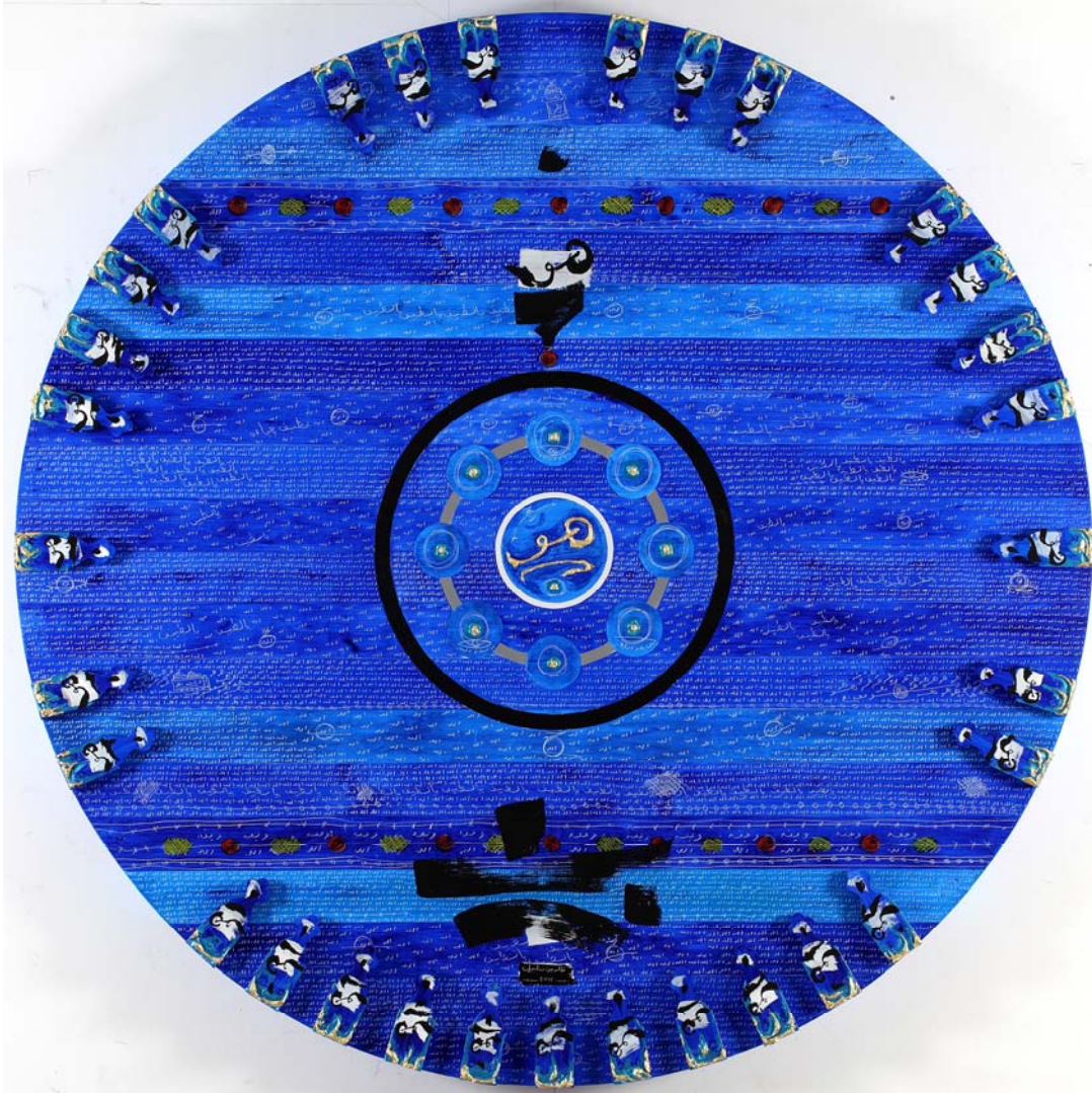
Khaled Ben Slimane, Les Soleils, 2016, Mixed media on wood, 202 x 202 x 13.5 cm