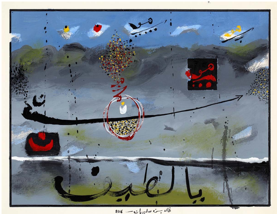
Khaled Ben Slimane, Ascension I, 2016, Acrylic on Arches paper, 50.3 x 66 cm