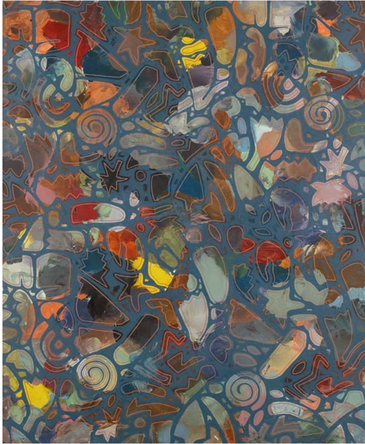
Untitled III, 2006 Acrylic on canvas 176x145 cm