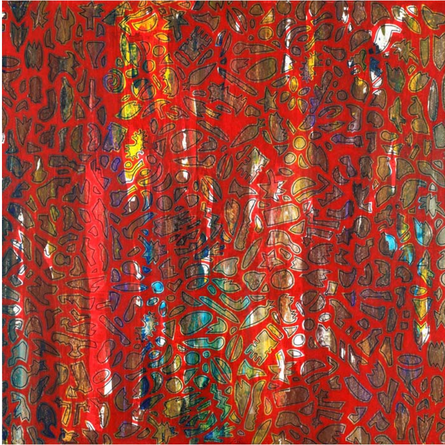
Untitled IX, 2006 Acrylic on canvas 149x149cm