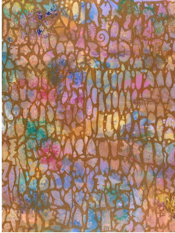
Untitled VIII, 2006 Acrylic on canvas 201x150 cm