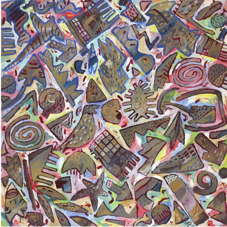
Untitled, 1993 Acrylic on canvas 120 x 120 cm